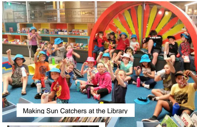
Making Sun Catchers at the Library