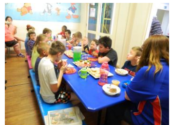
Scallywags Play Cafe