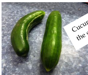
Cucumbers from the garden